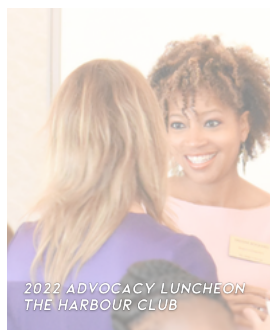
2022 ADVOCACY LUNCHEON THE HARBOUR CLUB