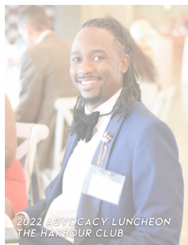
2022 ADVOCACY LUNCHEON THE HARBOUR CLUB