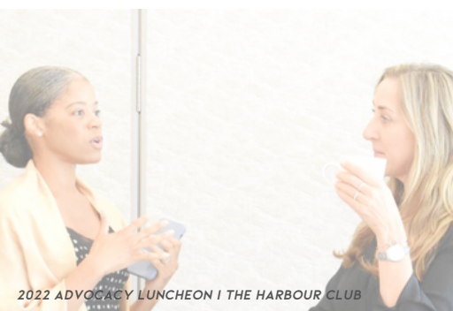
2022 ADVOCACY LUNCHEON | THE HARBOUR CLUB