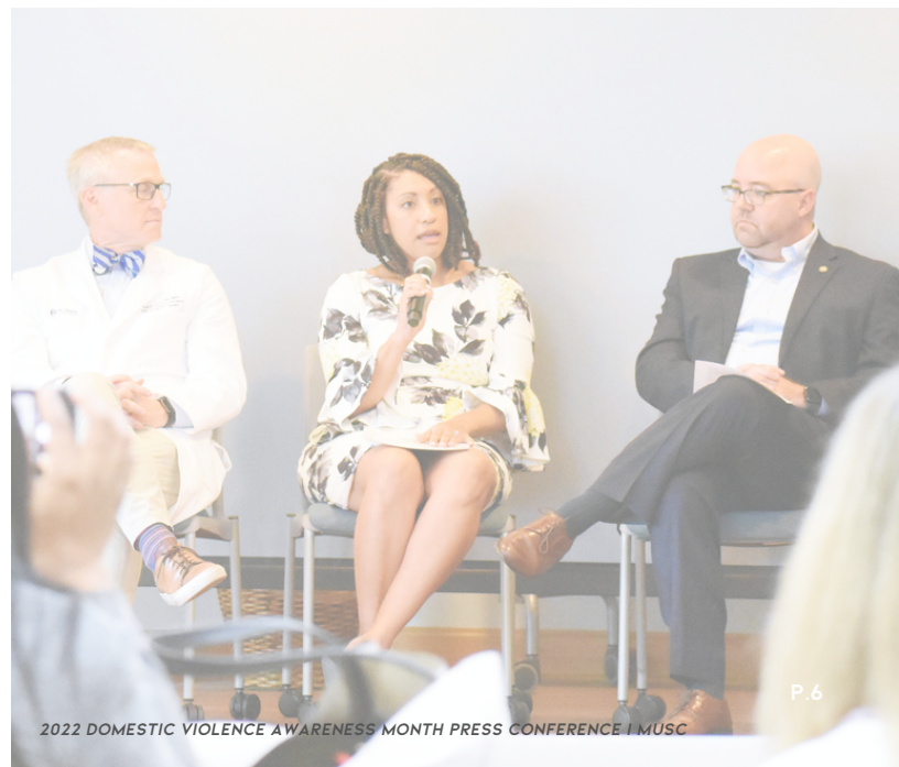
2022 DOMESTIC VIOLENCE AWARENESS MONTH PRESS CONFERENCE | MUSC