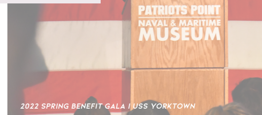
2022 SPRING BENEFIT GALA | USS YORKTOWN