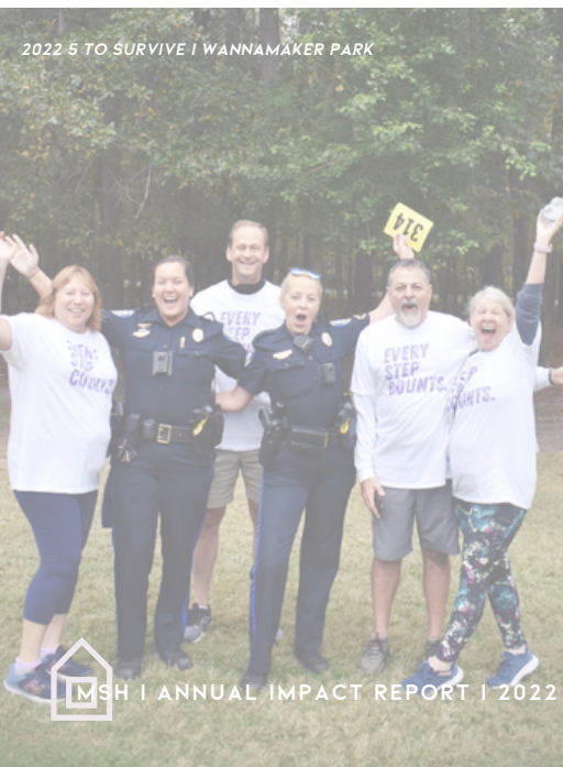
2022 5 TO SURVIVE | WANNAMAHER PARK