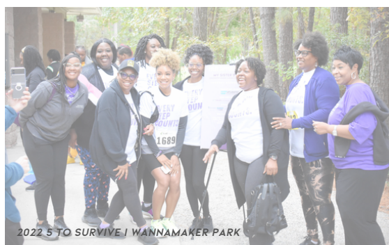
2022 5 TO SURVIVE | WANNAMAHER PARK