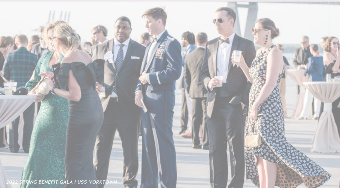
2022 SPRING BENEFIT GALA | USS YORKTOWN