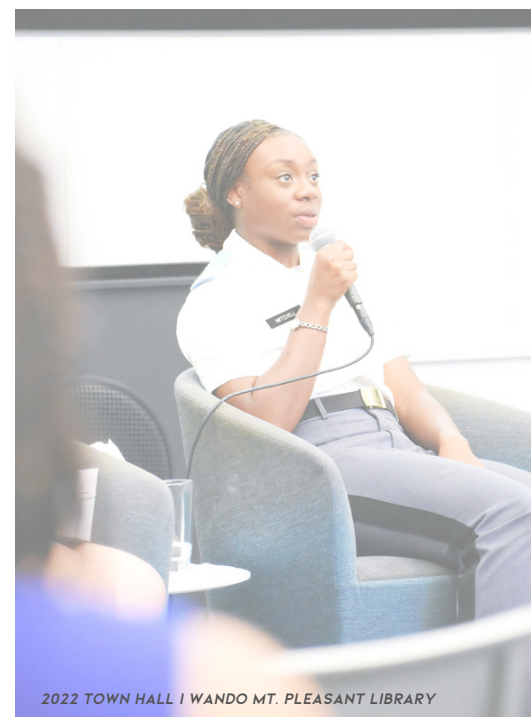
2022 TOWN HALL | WANDO MT. PLEASANT LIBRARY